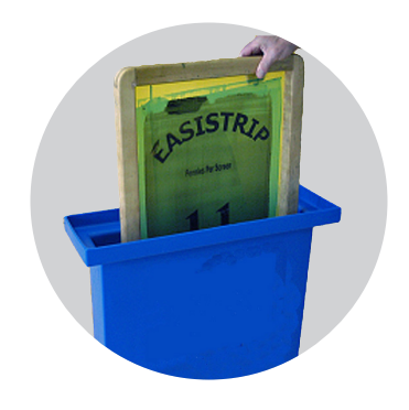
3. DIP SCREENS (1-3 MINS OR UNTIL FILM LOOSENS FROM MESH)