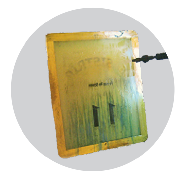
4. PRESSURE RINSE