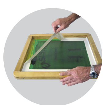
2. PULL TAPE