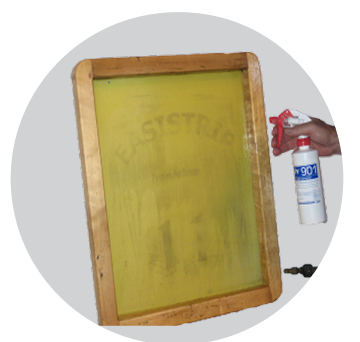
5. SPRAY EASIWAY STAIN REMOVER