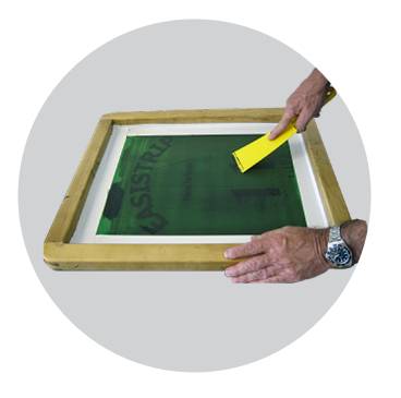
1. SCRAPE INK