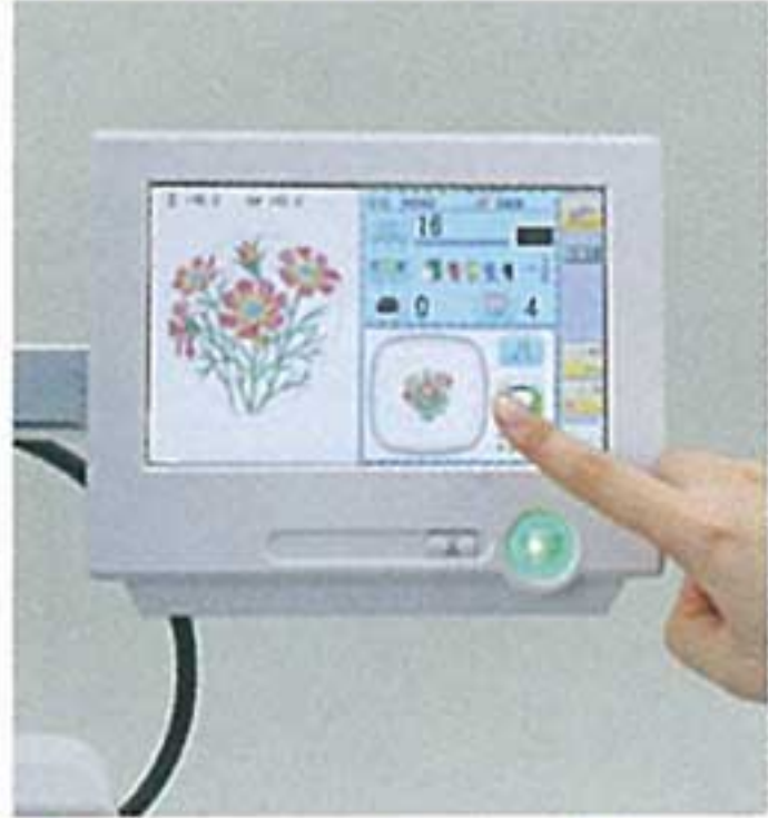
Touchscreen Control Panel Memory capacity: 999 designs/ 40 million stitches. Auto-error correction