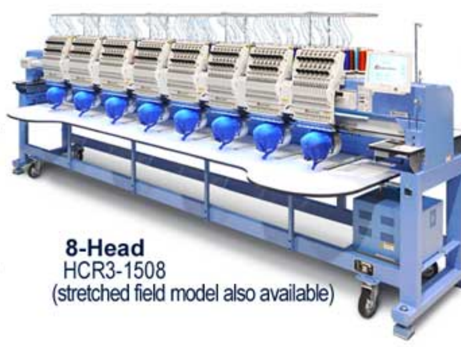
8-Head HCR3-1508 (stretched field model also available)