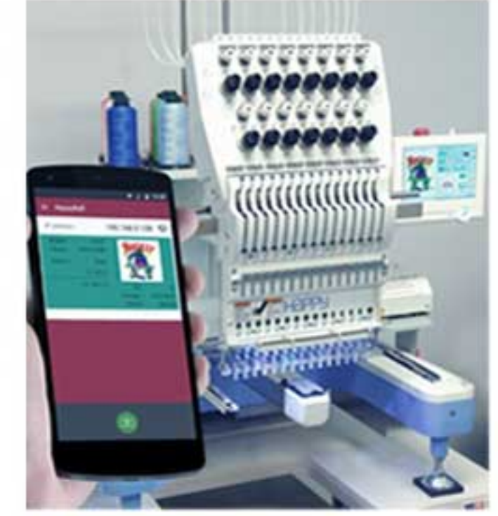
HAPPYBELL Application For monitoring machines wirelessly on mobile devices