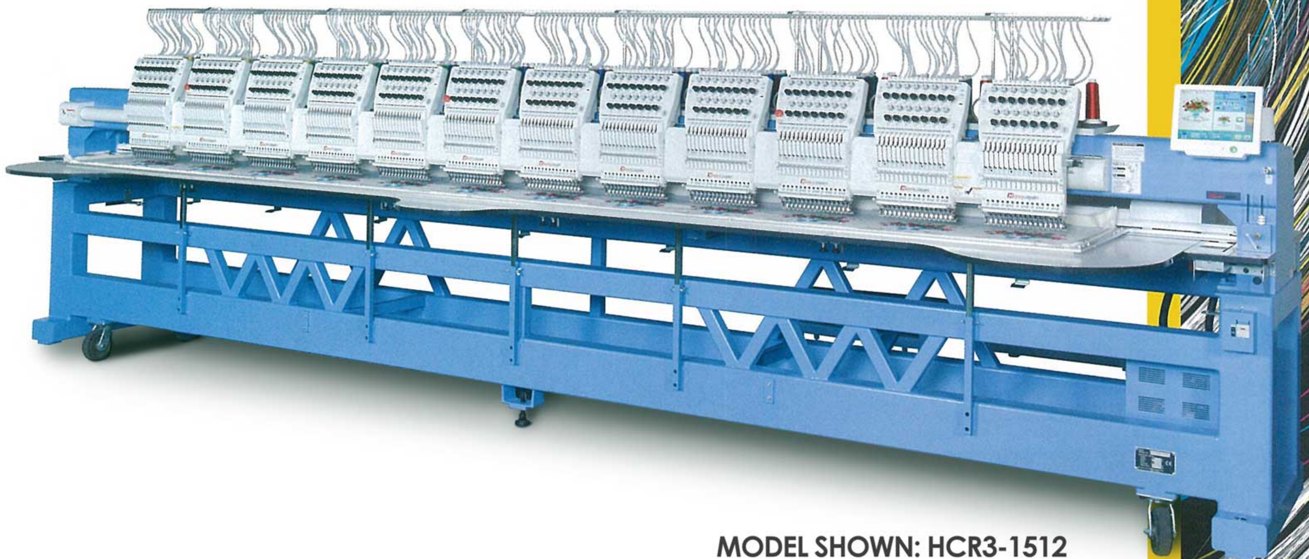
MODEL SHOWN: HCR3-1512

Industrial multi-head embroidery machines