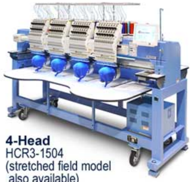
4-Head HCR3-1504 (stretched field model also available)