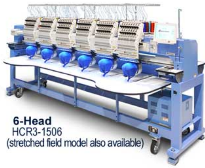
6-Head HCR3-1506 (stretched field model also available)