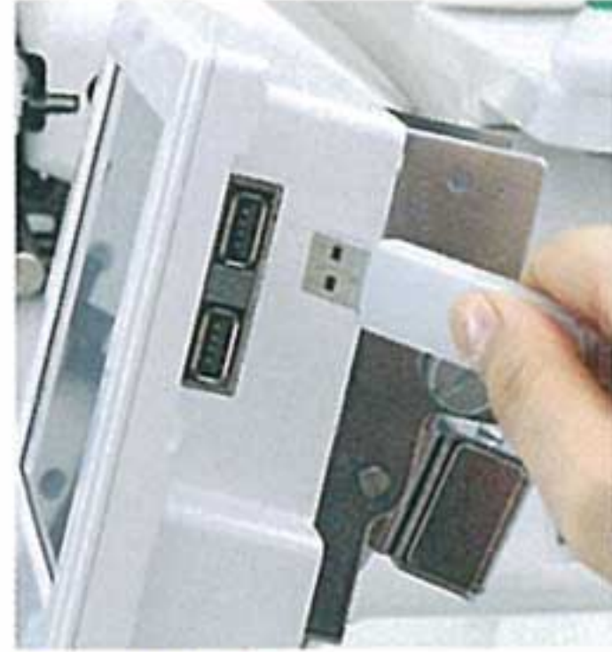
Dual USB Ports Accept most brands/capacities of USB thumb drives, USB mouse