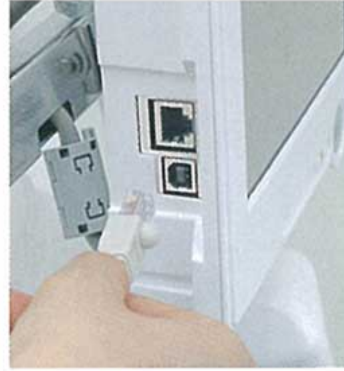
LAN/USB Connection Ports For optional live PC connection for design transfer/setup/management