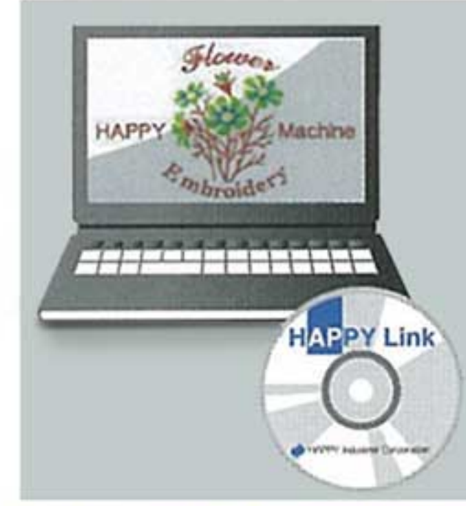
Included HAPPYLINK & LAN Machine networking, design transfer and editing software